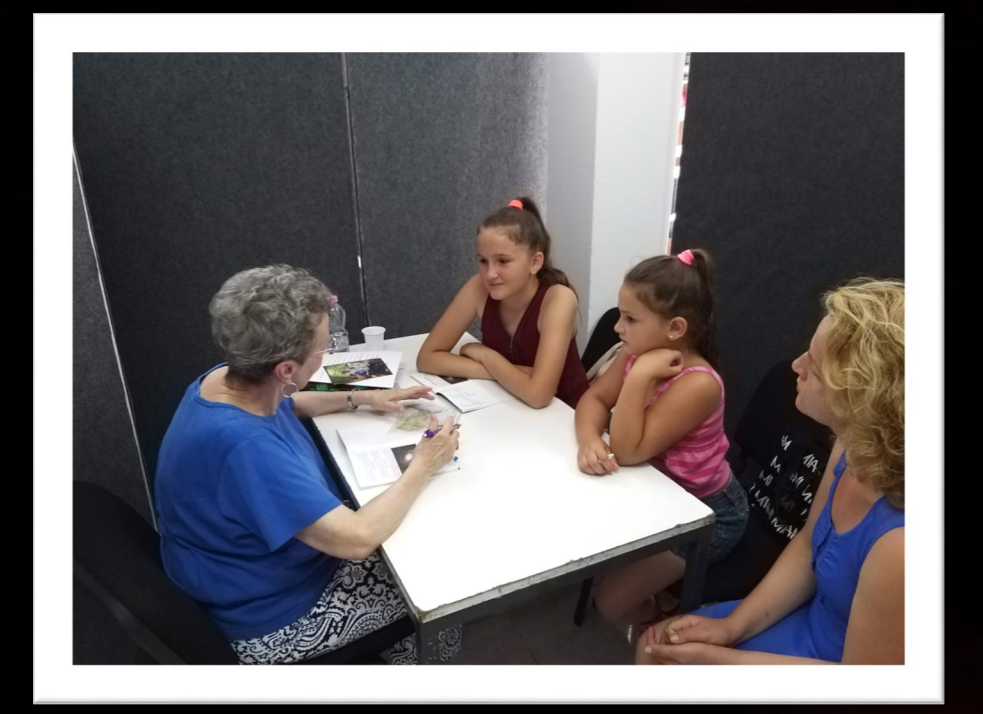
Some Pictures from the WEI Campaign 2019